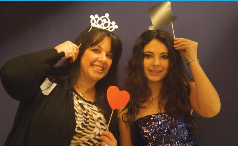
The Life Raft Group invited the local GIST community to a special Appreciation Dinner just to say thanks.

Awareness Day (GAD). As an offshoot of our successful Rare13 campaign, the goal was to raise awareness about GIST, bringing together people in a collaborative effort to educate and inform the public. As a symbol of GAD and of hope, we raised the challenge of folding 20,000 origami paper boats. Little did we know that this would become a worldwide effort, with over 130,000 boats from as far away as Mumbai folded and delivered to the LRG in time to be displayed in a photo booth at Life Fest 2014.