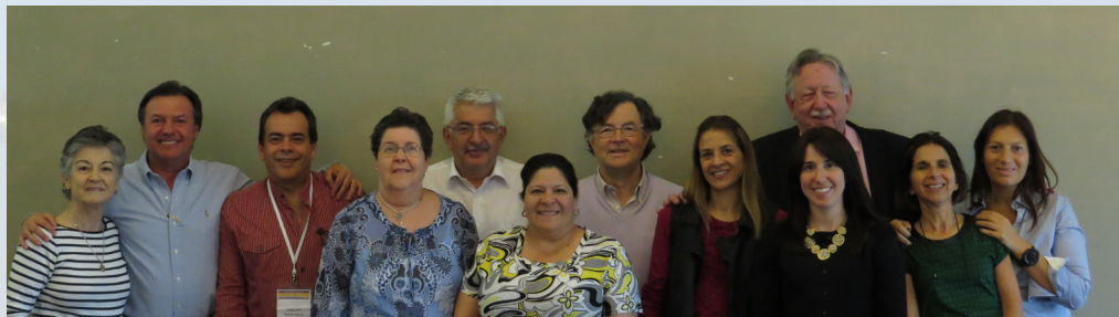
Alianza GIST meeting participants

Alianza GIST members from Argentina, Bolivia, Brazil, Colombia, Chile, Cuba, Venezuela, Guatemala, Mexico, and Spain joined representatives from the Life Raft Group in Zurich, Switzerland from May 14 to 17.