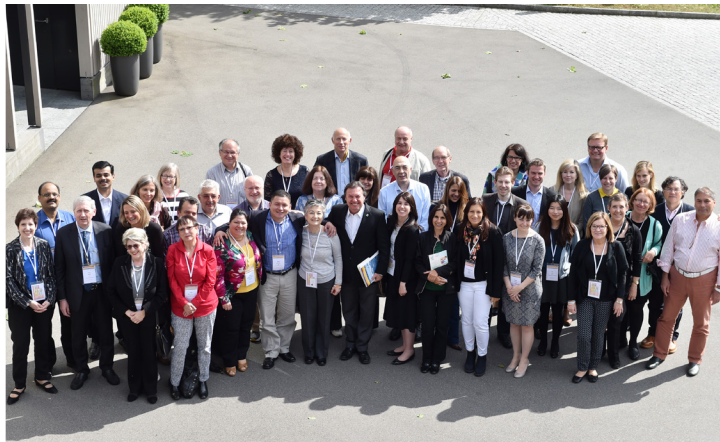
New Horizons meeting participants

terms of the number of countries represented, the strength of the international interactions, and the 'bench-strength' of the doctors and researchers present.