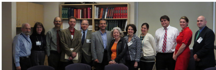
Participants at the NIH Clinic in Bethesda, MD

Specialized support services were tailored to a patient's age and family members' caregiver status. Seminars were held on topics ranging from Anxiety, Nutrition, Active Living and Alternative Medicine.