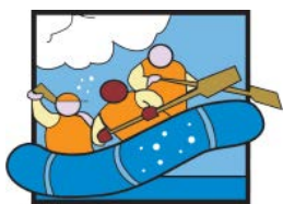
The Life Raft Group

The Life Raft Group became a formal non-profit on June 10, 2002. Our one-of-a-kind patient registry began. The first formal patient gathering was held in Cambridge, Mass.