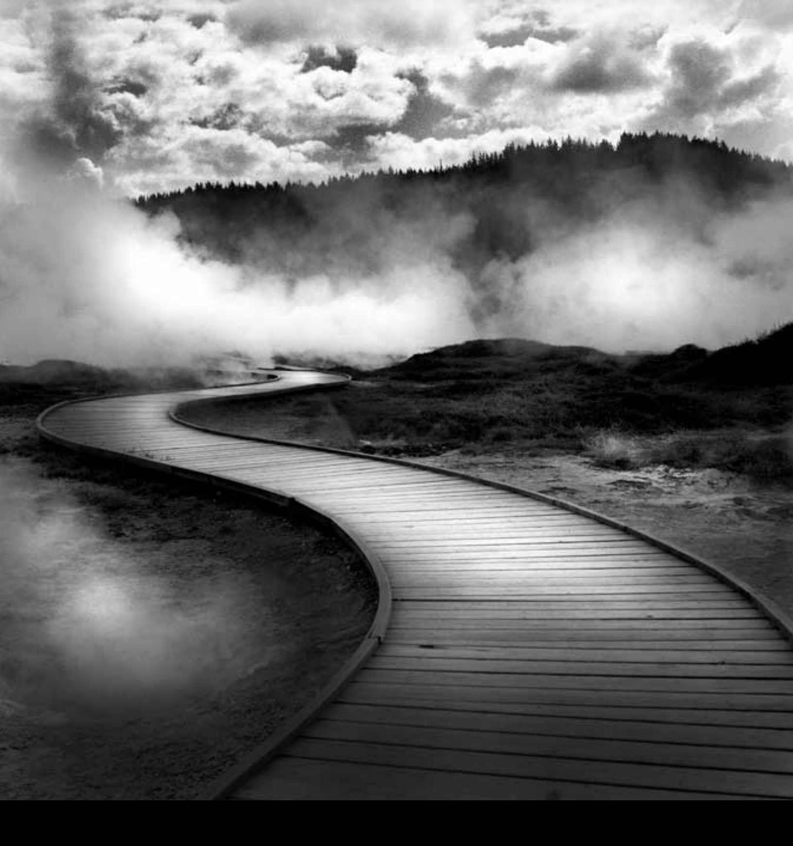
Pathways to Survival