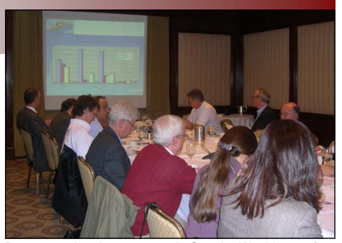
Doctors and patients met up in Seattle, Washington for a meeting to discuss the planning of an NIH pediatric GIST clinic.

NIH will pay for the travel and lodging for the patient (child) and one parent if it is required. Reimbursed travel would have to begin within the United States or its territories. An attempt will be made